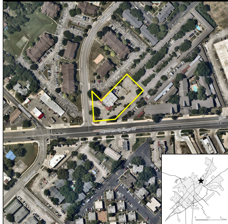
CUP-20-13 Aerial View Longhorn Daiquiri — 1617 Aquarena Springs Drive