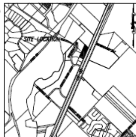
LOCATION MAP Scale: 1" = 200'