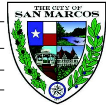
Exhibit B - Redlined Code