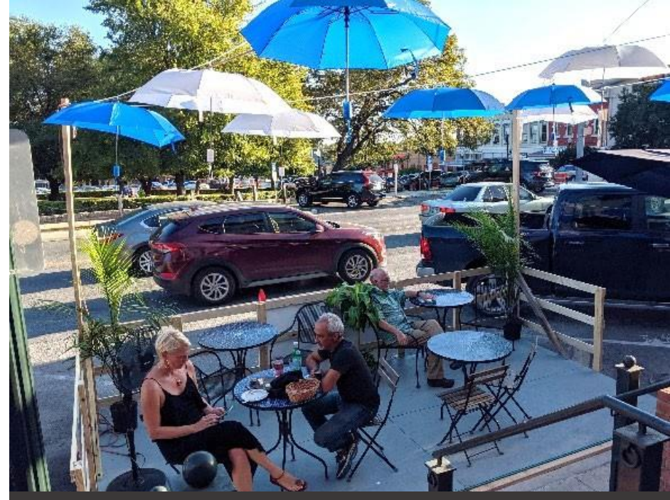
Blue Dahlia Bistro Temporary Parklet Installation: Park(ing) Day 2019