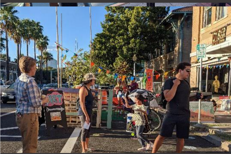
218 Studio Co-Op Temporary Parklet Installation: Park(ing) Day 2019