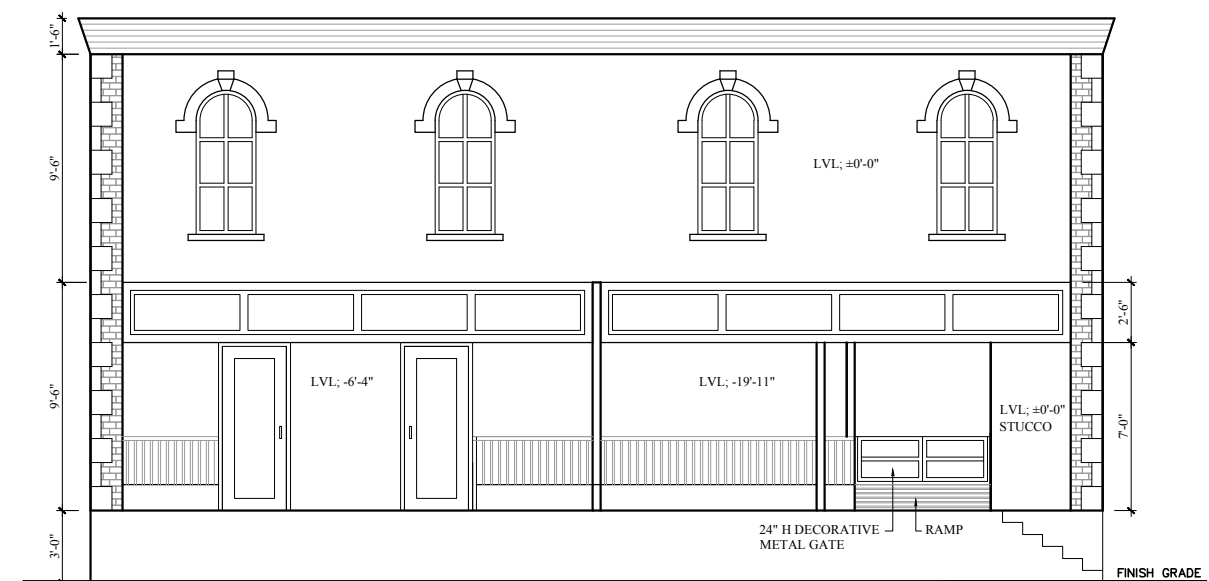
2 FRONT ELEVATION SCALE : 1/8" = 1'-0"