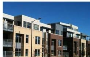
Wall Offset; Horizontal Expression Line; Materials Change