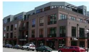
Varied Upper Floor Massing; Wall Offset