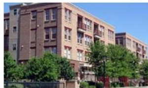
Vertical Expression Lines; Cornice; Balcony

The following photographs provide examples of improvements that illustrate how some of the design guidelines may apply in CD-5D and CD-5. Some specific design features are identified in the captions. Note that, in some cases, while a specific design feature is described as being an appropriate example, the overall building shown may not meet all of the city's other design standards and guidelines.