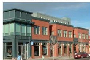
Wall Notch; Horizontal Expression Line