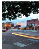
Downtown Plano has a vibrant future with an engaging atmosphere. The streetscape is pedestrian friendly, and has potential to generate a significant amount of income for the community.