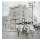
The historic presence of Downtown Plano is still strong throughout the character in each building. This character creates an exciting juxtaposition between the past and present, and is critical in preserving to increase the vitality of the Downtown Heritage District.