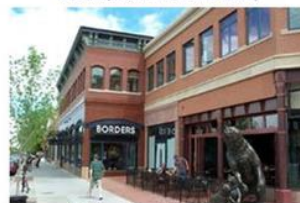
Wall Offset; Horizontal Expression Line