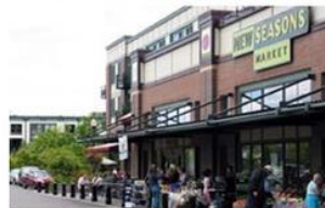
Vertical Expression Lines; Awning / Canopy