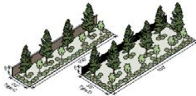
TABLE 7.8 TYPE C AND D PROTECTIVE YARD STANDARDS