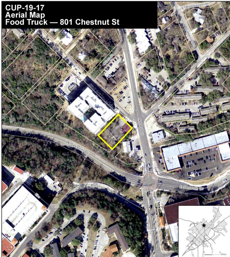
CUP-19-17 Aerial Map Food Truck — 801 Chestnut St