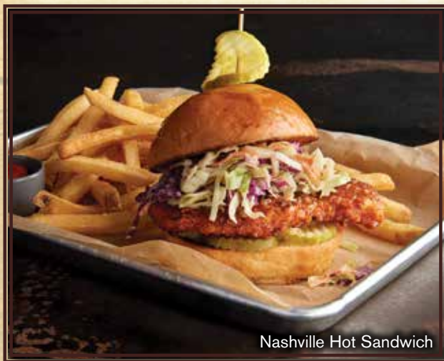
Nashville Hot Sandwich

Cheeseburger* (830 cal) ..... 11.99 Fresh ½ lb. burger, American cheese, lettuce, tomato, onion, pickles, homemade bun.