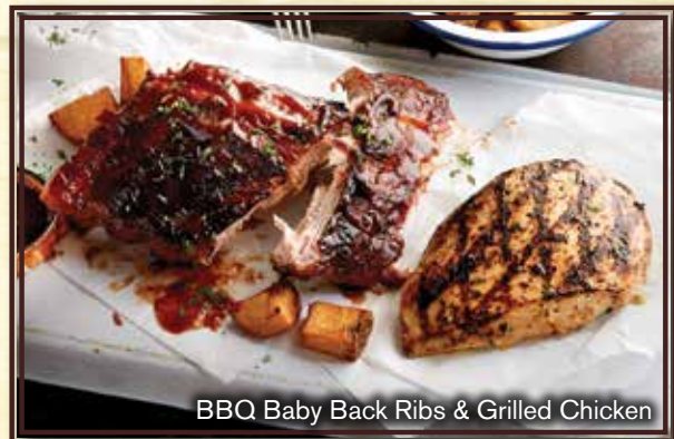
BBQ Baby Back Ribs & Grilled Chicken

Marinated grilled chicken breast & choice of fried, grilled or BBQ shrimp.