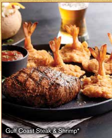
Gulf Coast Steak & Shrimp*