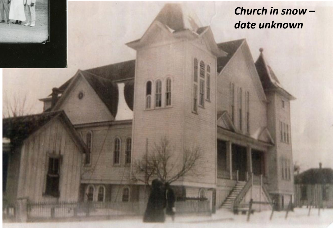
Church in snow – date unknown