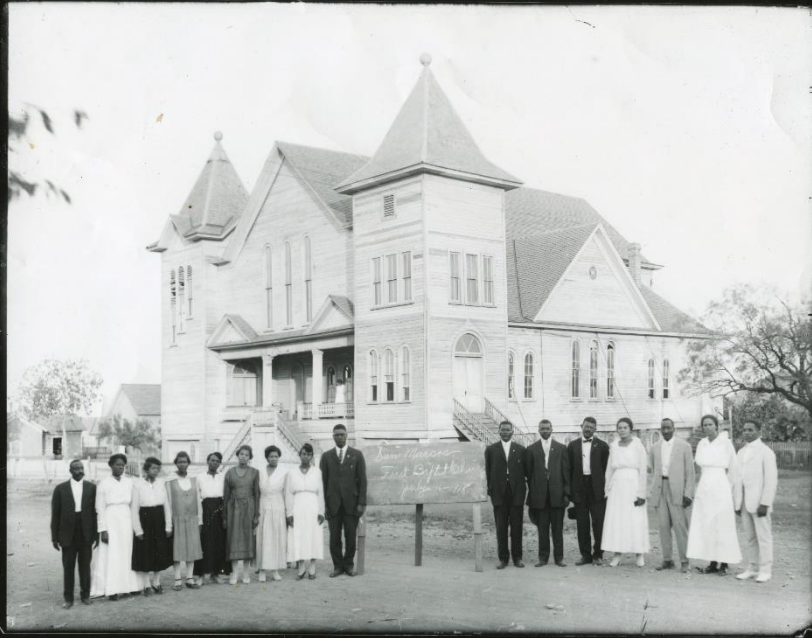
Church Choir - 1918