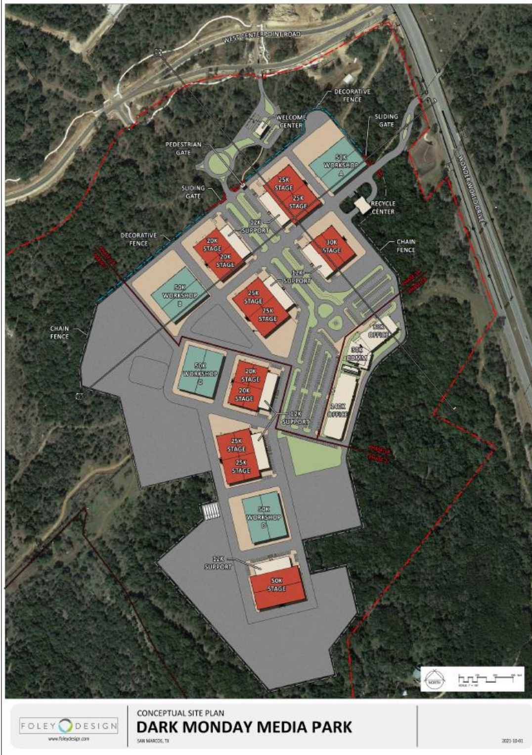
Exhibit "B" Site Plan