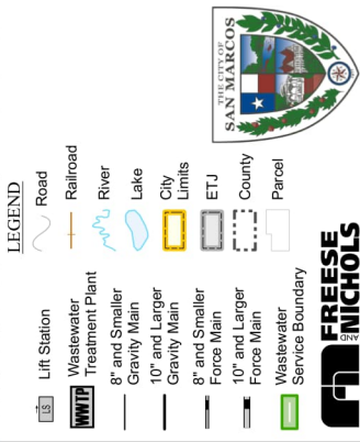
FIGURE 3-1 CITY OF SAN MARCOS EXISTING WASTEWATER SYSTEM