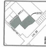
LOCATION MAP NOT-TO-SCALE