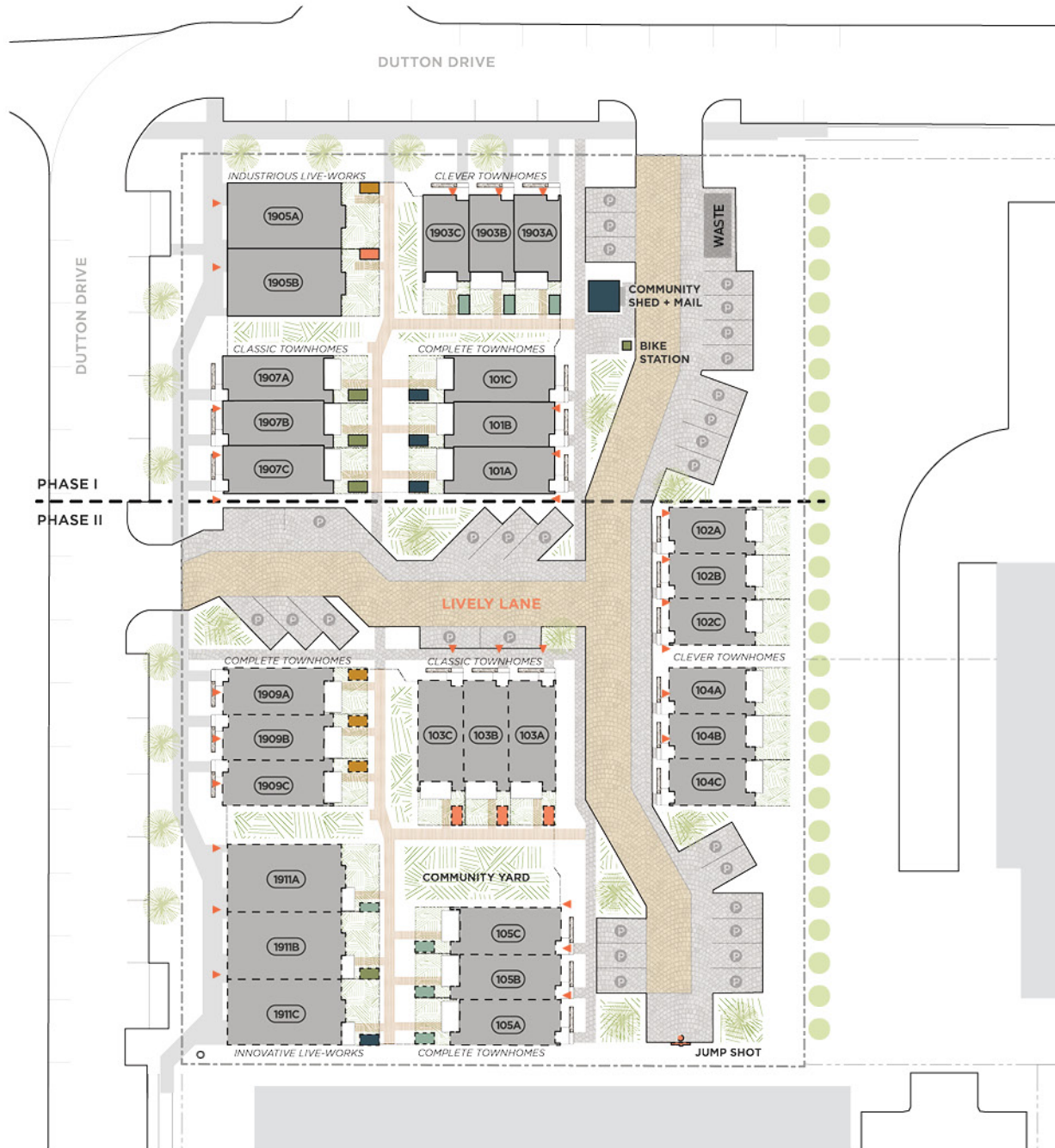
PHASE I + PHASE 2 SITE PLAN (FULL LOT)