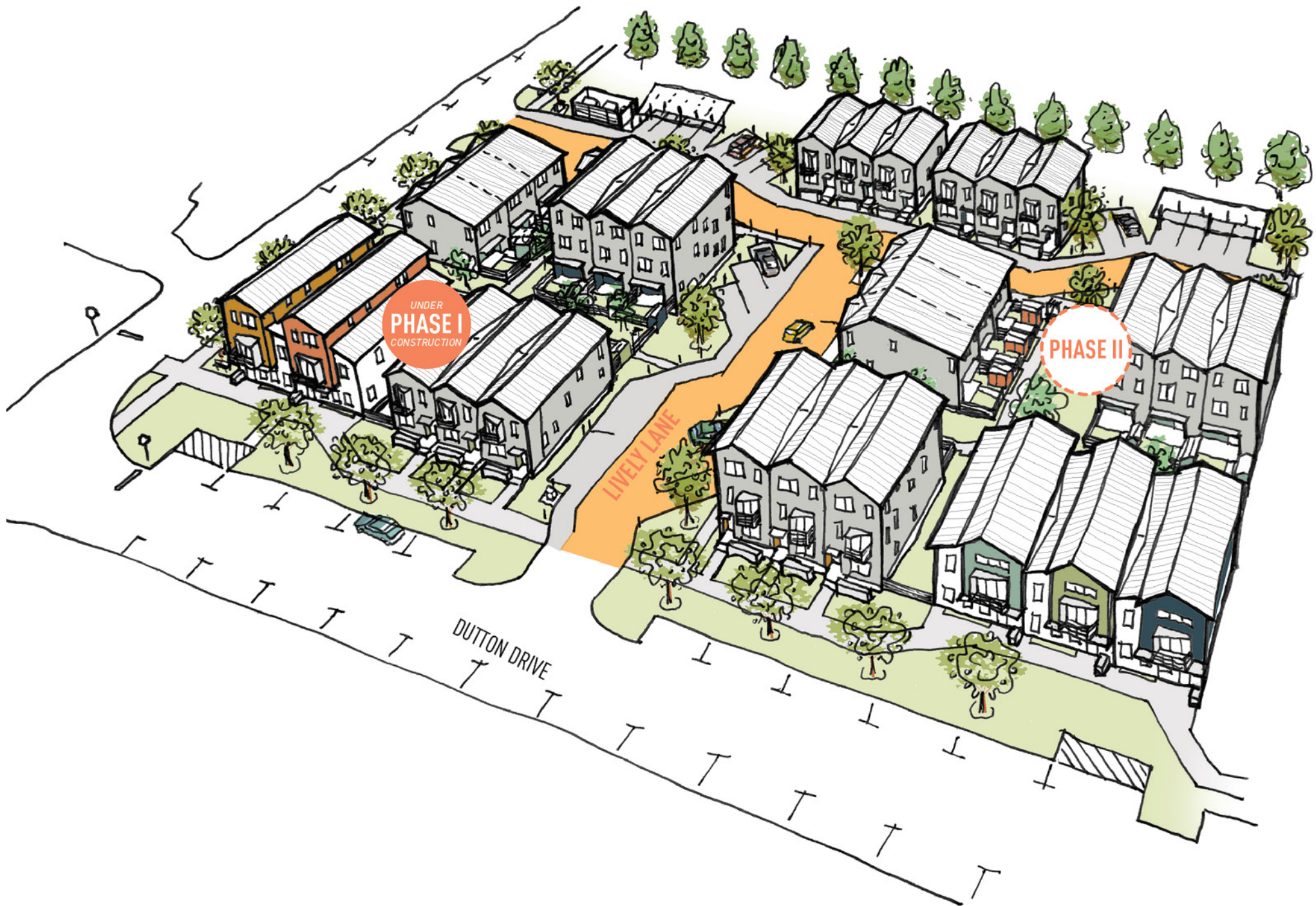
BIRD'S EYE PERSPECTIVE (ILLUSTRATIVE MASSING)