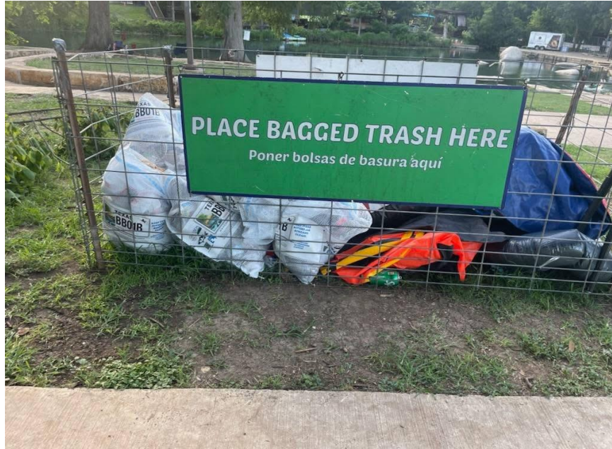
Eyes of the San Marcos River – Monday, June 9