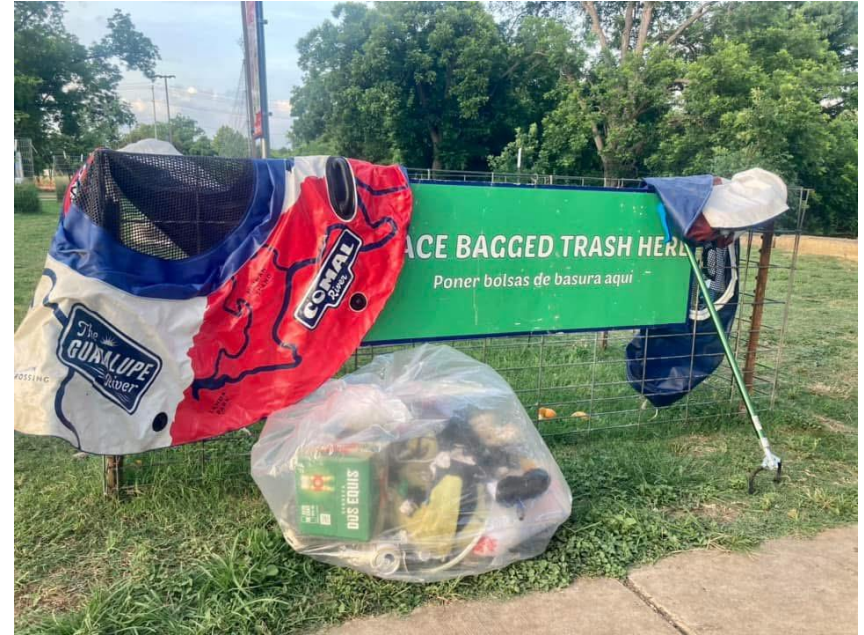
Eyes of the San Marcos River – Monday, June 9