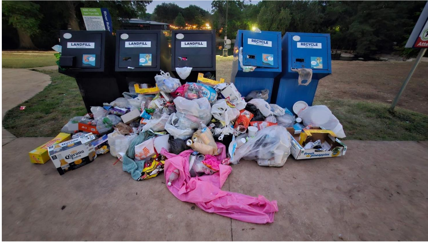
Eyes of the San Marcos River – Monday, May 19