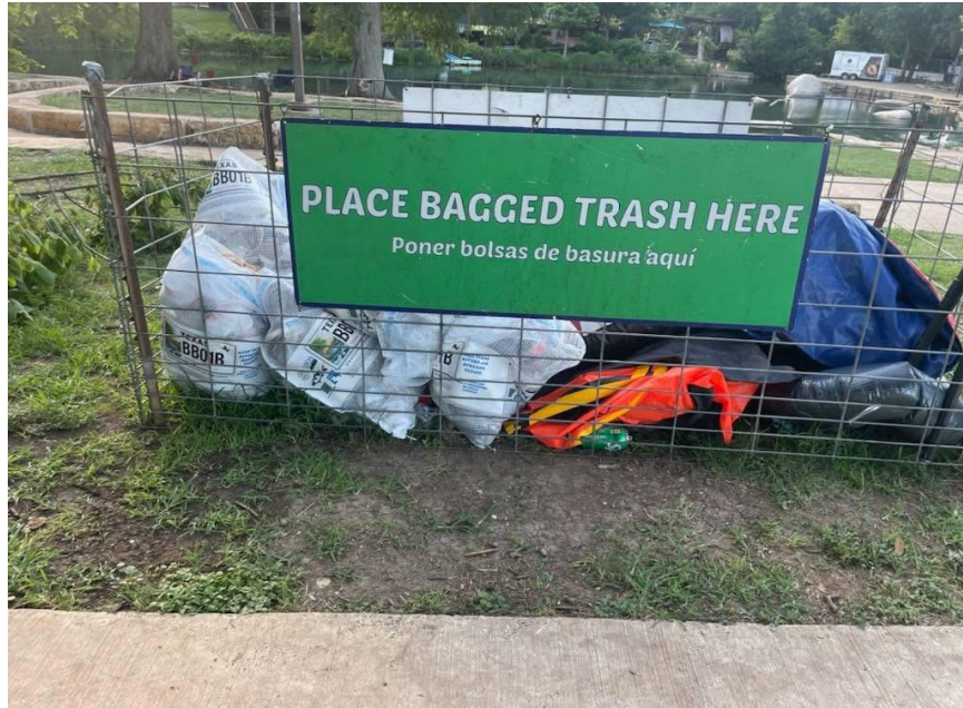
Eyes of the San Marcos River – Monday, June 9