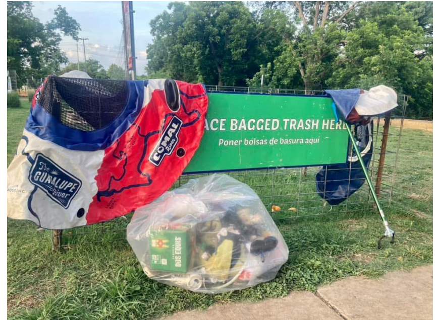
Monday, June 9