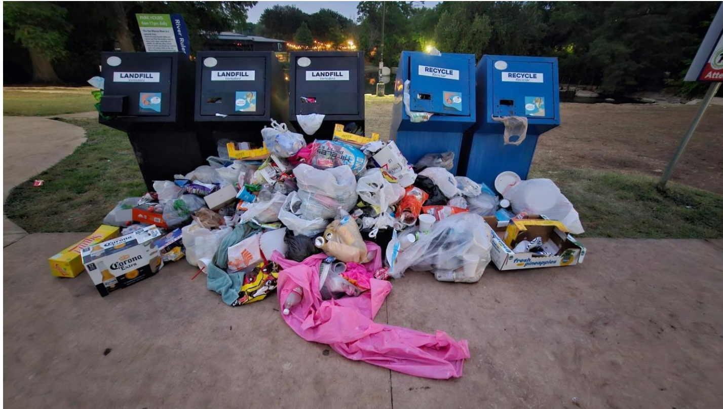
Eyes of the San Marcos River – Monday, May 19