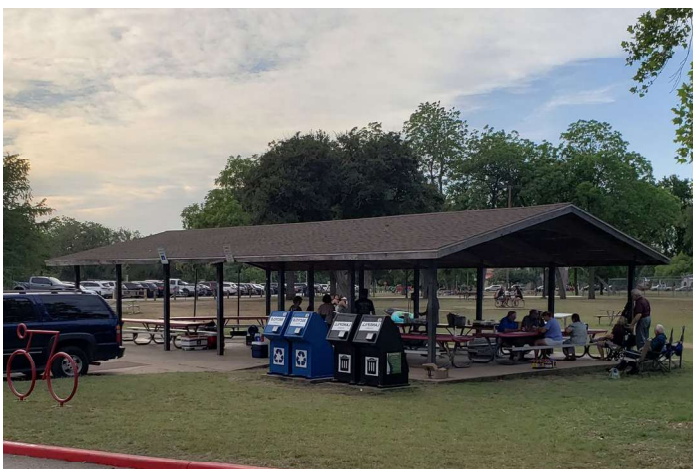
Pavilion located in Rio Vista Park