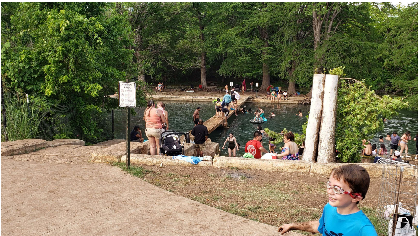
Some aspects of the Riverfront Parks system lack sufficient accessibility for disabled individuals visiting the riverfront.