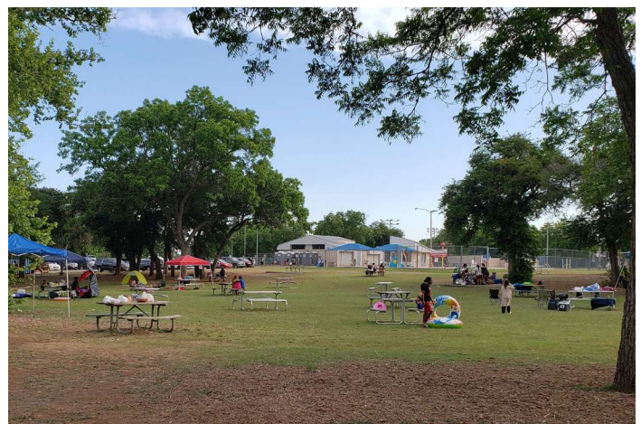
Open Lawn/Open Play Space located in Rio Vista Park