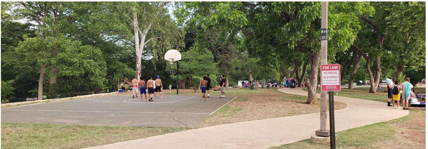
Trail along Rio Vista Park provides pedestrian and bicycle access throughout the Riverfront Parks.

Respondents understand that the existing locations of tennis and pickleball courts, the swimming pool, and the baseball fields are subject to constraints which conflict with existing amenities and limit expansion and improvement opportunities. When presented with options to relocate within the Riverfront Parks System, relocate outside of the Riverfront Parks System, leave them in their current locations, or remove them and rely on other existing locations, respondents preferred to relocate those activities to sites outside of the Riverfront Parks System.