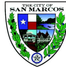
Exhibit B - Redlined Code